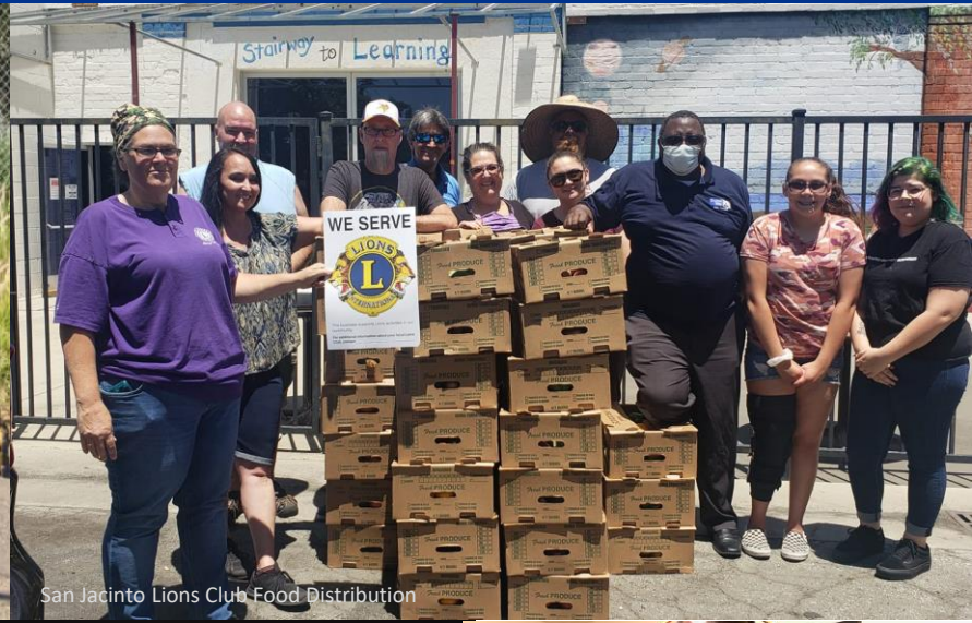
San Jacinto Lions Club Food Distribution