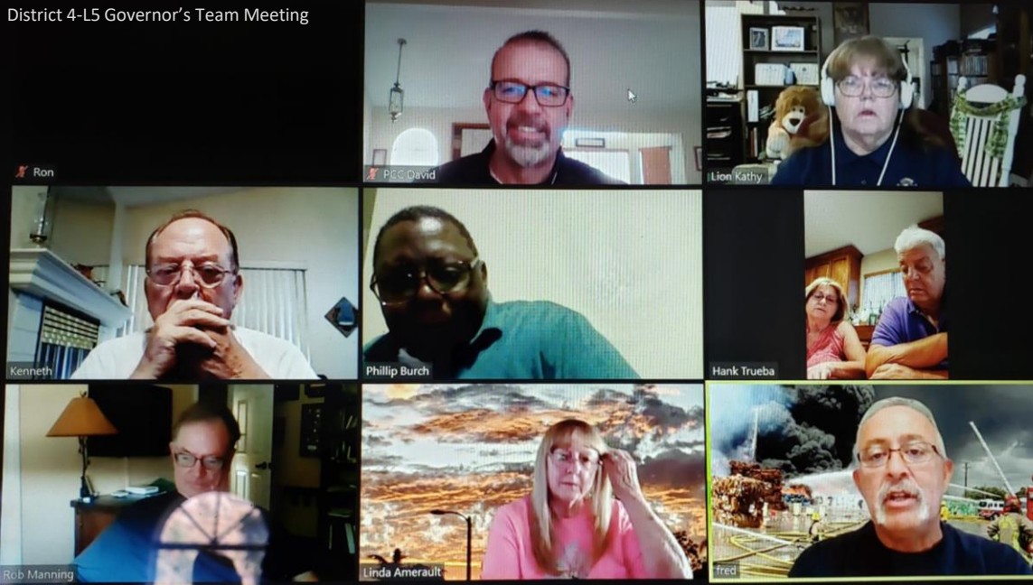
District 4-L5 Governor's Team Meeting