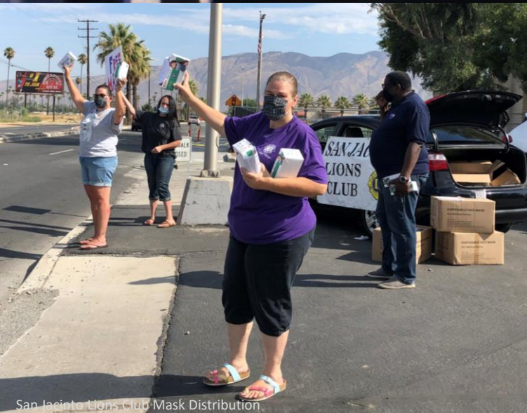
San Jacinto Lions Club Mask Distribution