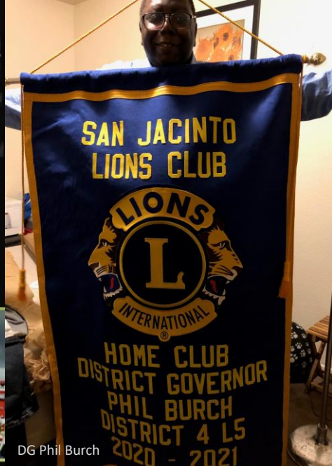
DG Phil Burch