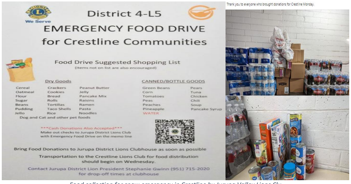
Food collection for snow emergency in Crestline by Jurupa Valley Lions Clu