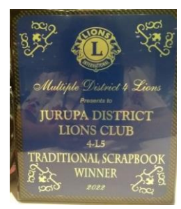
Congratulations to Jurupa Lions