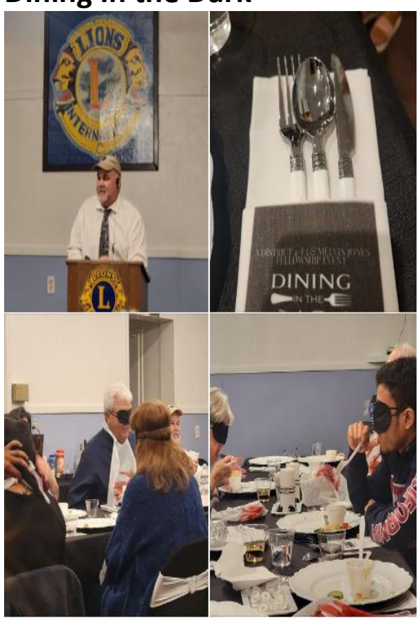
Dining in the dark event Jurupa Valley Lions March 4th 2023

The Dining in the Dark LCIF fundraiser for our district was amazing!