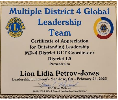
Awards to our own GLT