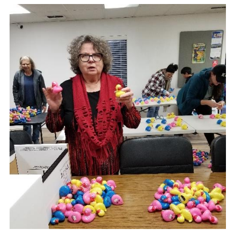
Counting 4000 ducks for Chamber of Commerce Easter Duck Derby.

Thank goodness my partner and I only had 600.